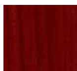
Western Red Cedar

Choose from 8 realistic long lasting colours